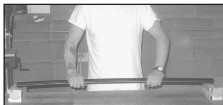
Decrease Rail Bow